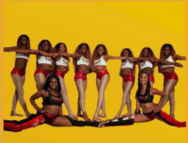
RED ROSE MAFIA DANCE TROUPE